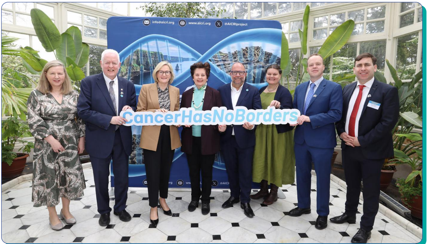
Commissioner Mairead McGuinness (2020–2024) with participants and organisers of the Joint Euro-American Forum on Cancer 2024.