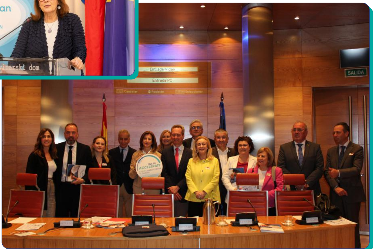
Below: Time to Accelerate event, Madrid, Spain, May 2024