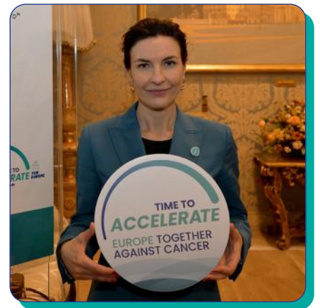
Alessandra Moretti MEP, Italy*