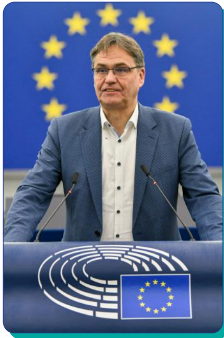
Peter Liese MEP, Germany