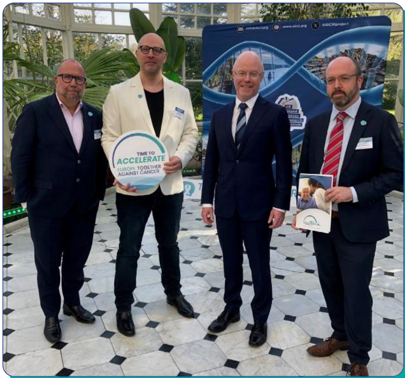
Irish Minister for Health Stephen Donnelly with ECO at the Joint Euro-American Forum on Cancer 2024