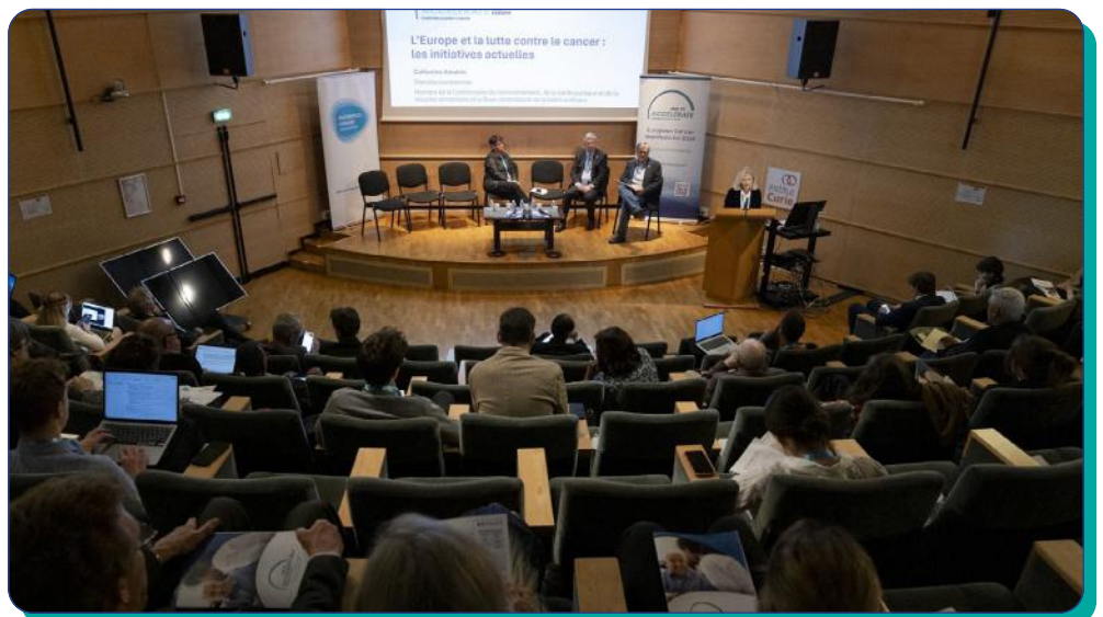
Time to Accelerate event, Paris, France, May 2024