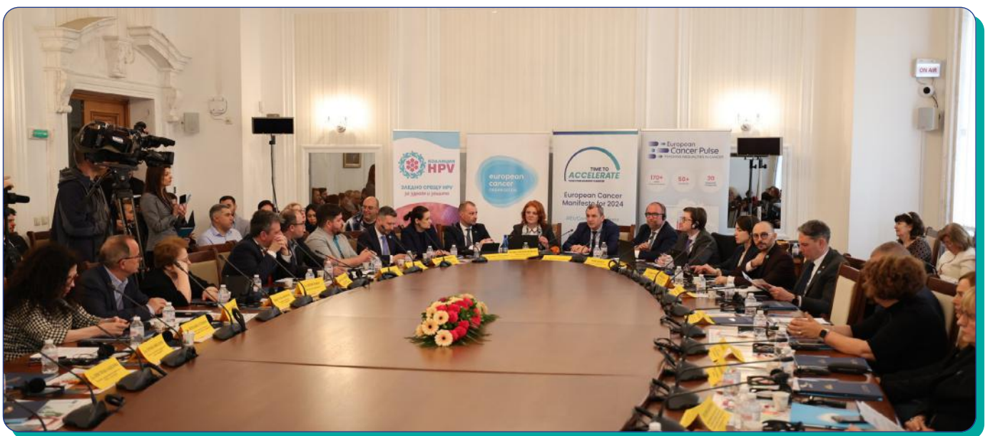
Time to Accelerate event, Sofia, Bulgaria, March 2024