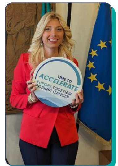
Italian Senator Elena Murelli