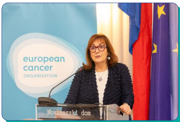
Left: Dubravka Šuica MEP, Croatia