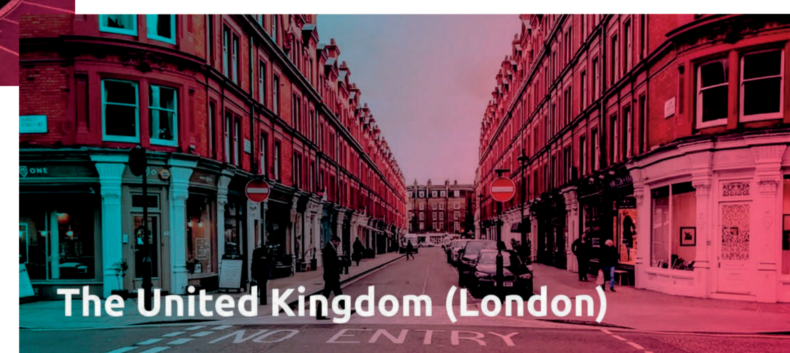
The United Kingdom (London)