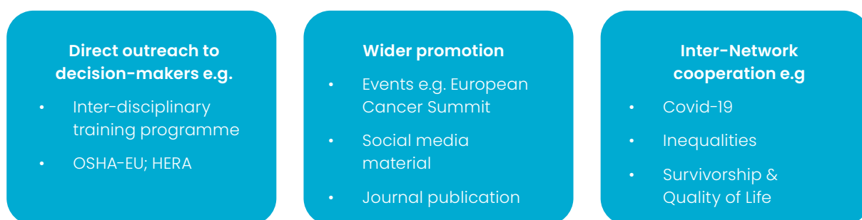
Figure 2. The Next Steps

To achieve all that, the Workforce Network is calling for direct outreach to decision makers, wider promotion of the recommendations via events such as the European Cancer Summit, social media and journal publications, and cooperation with the